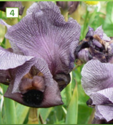
4 GILBOA IRIS - 1970 Unique species of majestic flower saved from extinction after building plans cancelled