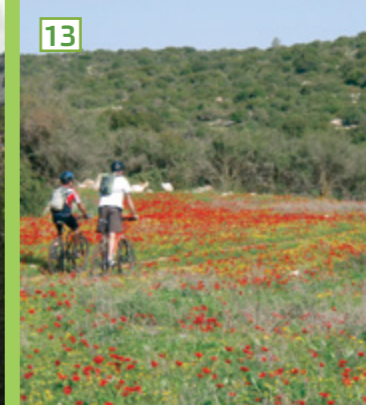
VALLEY OF ELAH 2010-14 Biblical valley saved after experimental oil shale fracking process banned