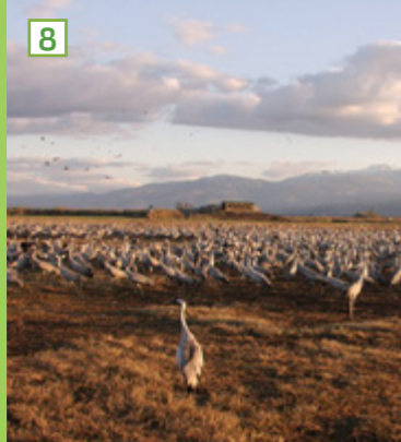
8 CRANE FEEDING PROJECT 1992 - PRESENT Groundbreaking conservation initiative creates international eco-tourism attraction, assists farmers and aids migrating birds.