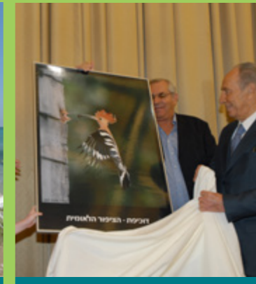
ELECTING THE NATIONAL BIRD 2008 Hoopoe chosen as official state symbol after 150,000 people vote in our national competition