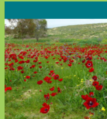
WILDFLOWER CAMPAIGN 1963-69 Israel's most influential public campaign created behavioral change preventing extinction of wildflowers from over-picking