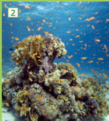
2 CORAL REEFS - 1955 Eilat's coral reefs saved as coral picking made illegal and coastal nature reserve established