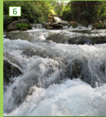
6 LAND OF THE RIVERS 1978-84 Kibbutzniks and SPNI prevent redirection of upper Dan River's tributaries saving famous Baniyas