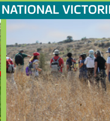
CHILDREN LEADING CHANGE 1970 Environmental education mainstreamed in public schools as SPNI's programs adopted nationwide by Ministry of Education