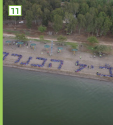
11 KINNERET CIRCULAR TRAIL 2004 Unhindered public access to Sea of Galilee's entire shoreline assured