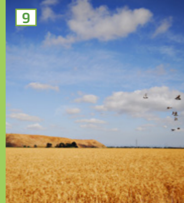
9 ARIEL SHARON PARK 1998-2014 Israel's largest landfill transformed into Tel Aviv's own 'Central Park'