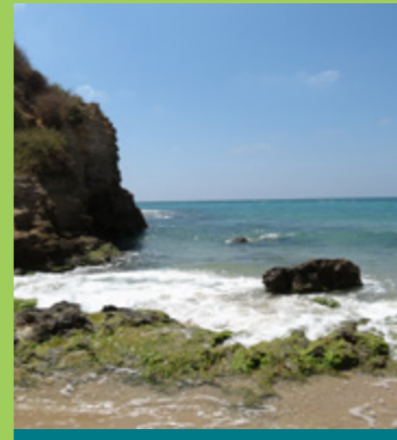
COASTAL LAW 2004 Initiated law that ensures Israel's untouched beaches remain accessible and free for the public