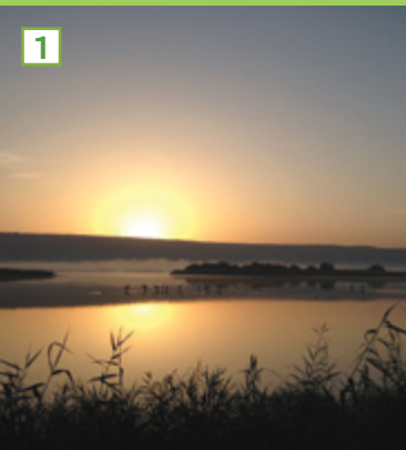
1 HULA WETLANDS 1953-1993 SPNI vindicated after 40 years as previously-drained wetlands reflooded and returned to nature