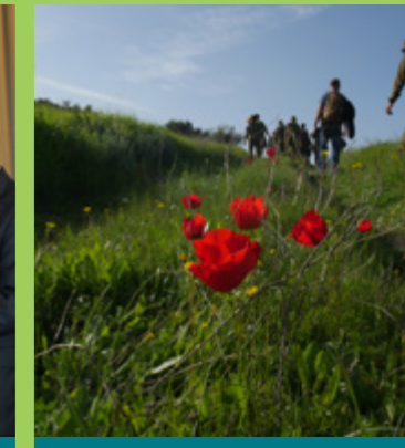
ARMY FOR PROTECTION OF NATURE 2014 Empowers and supports IDF in development of innovative conservation projects in secured areas