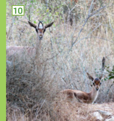
10 GAZELLE VALLEY 1999-2015 Israel's first urban wildlife park established after public struggle and planning process