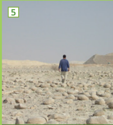
5 HAR TZIN 1974-80 Unique geological formation of 'Bulbusim' boulders saved after railway line cancelled