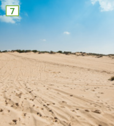
7 ASHDOD DUNES 1983-1991 Israel's last natural dune habitats turned into nature reserve