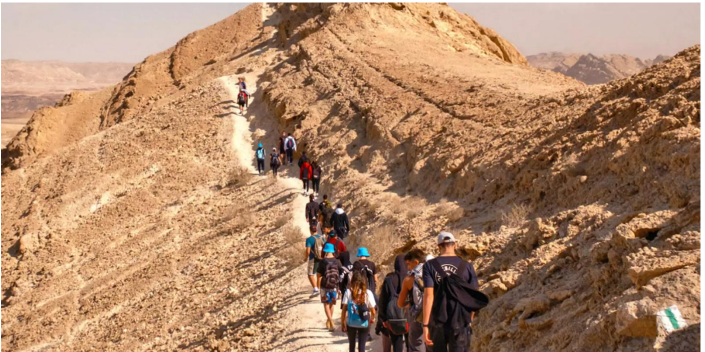
Youth from Kibbutz Bror Hayil, located in the Gaza Envelope, receiving a taste of freedom after being evacuated to crowded hotel rooms

We are deeply thankful to you for your past support of our Nature Heals eco-therapy project that has helped over 110,000 traumatized Israelis since the horrific events of October 7. We hope you will renew your support for this project in the coming year. Thank you.