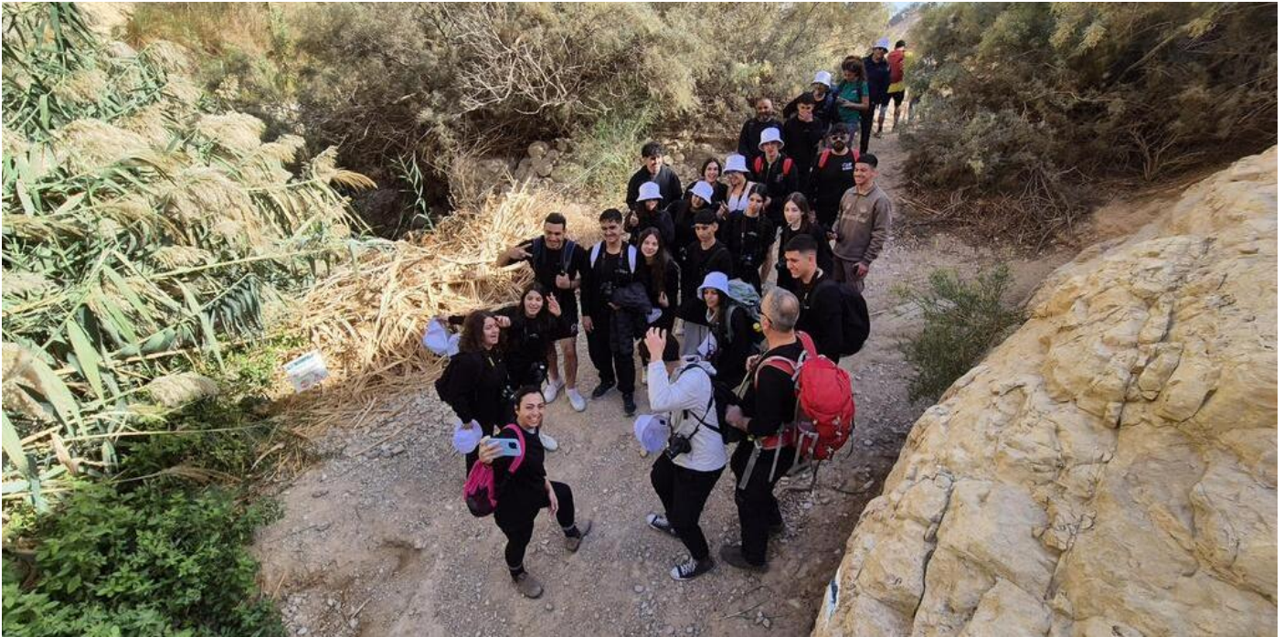
Teens from the Druze community of Majdal Shams embarking on a Resilience Journey