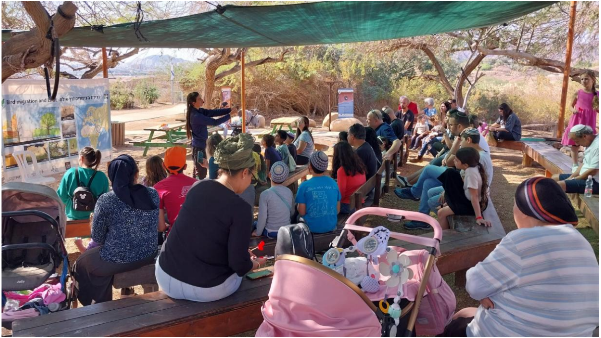
Tens of thousands of internally displaced refugees received a warm welcome at our Eilat Bird Center