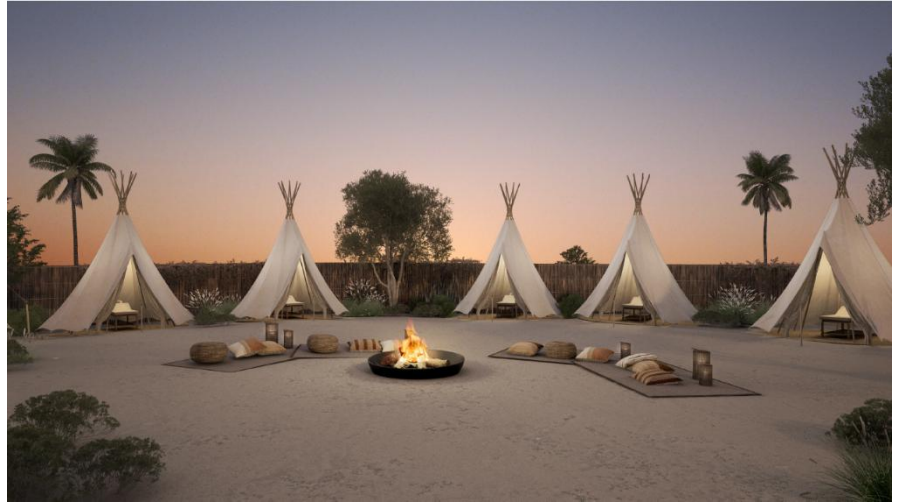
An artist's rendering of the planned Eco-Therapy Retreat in Eilat

SPNI, Sheba Medical Center and the Eilat Municipality have agreed to establish an eco-therapy retreat for IDF soldiers who need time to process their experiences before returning to their routine. Located on the grounds of our Eilat Field School on the shores of the Red Sea, experts in trauma treatment will provide professional psychological therapy in a peaceful, natural setting using this cutting-edge combination of trauma treatment with our eco-therapy expertise.