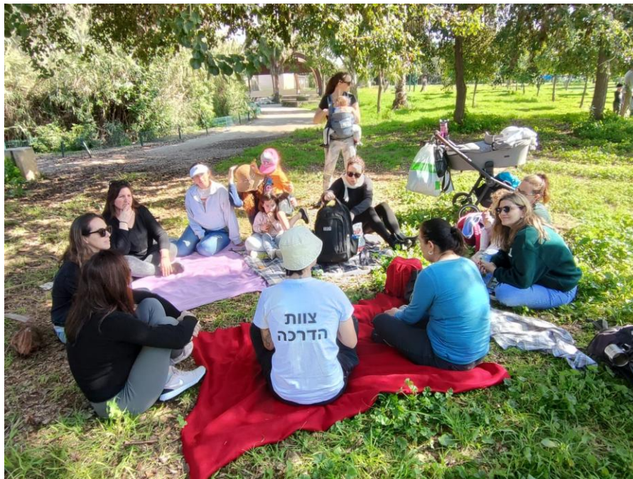
A group of wives and partners enjoying some respite in nature

Two thousand five hundred participants joined our family-friendly eco-therapy activities for reservists and their families at no cost. With families of reservists underprecedented emotional strain due to a parent serving in the reserves, SPNI, in partnership with local municipalities, organized eco-therapy activities designed for young families. SPNI guides took parents on a quiet walk in nature, and a second guide took younger children on an alternative route where they could expand their energy. At the end of the tour, parents and children joined together to complete an arts and crafts activity.