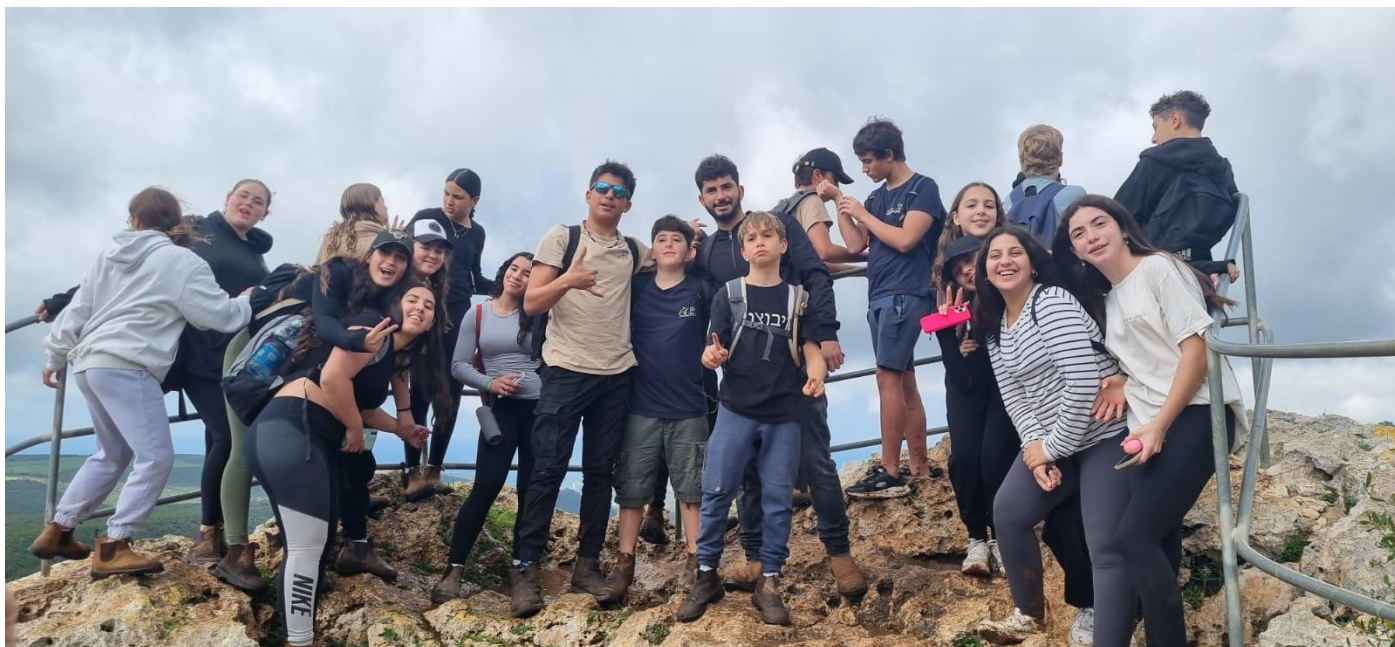
A group of teens from Mateh Asher enjoying the view after completing a challenging ascent