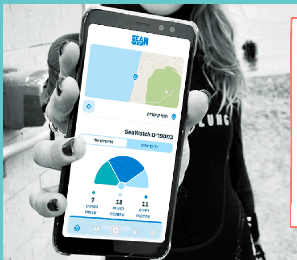
SEAWATCH APP, SPNI

SPNI's Blue Half conducts deep-sea surveys to explore and protect underwater canyons and works to conserve coral reefs, seagrass beds, shorelines, and deep-sea areas as one connected ecosystem . In partnership with the Eilat Municipality and Nature Israel, the program also reduces nighttime beach lighting to minimize harm to corals and marine wildlife.