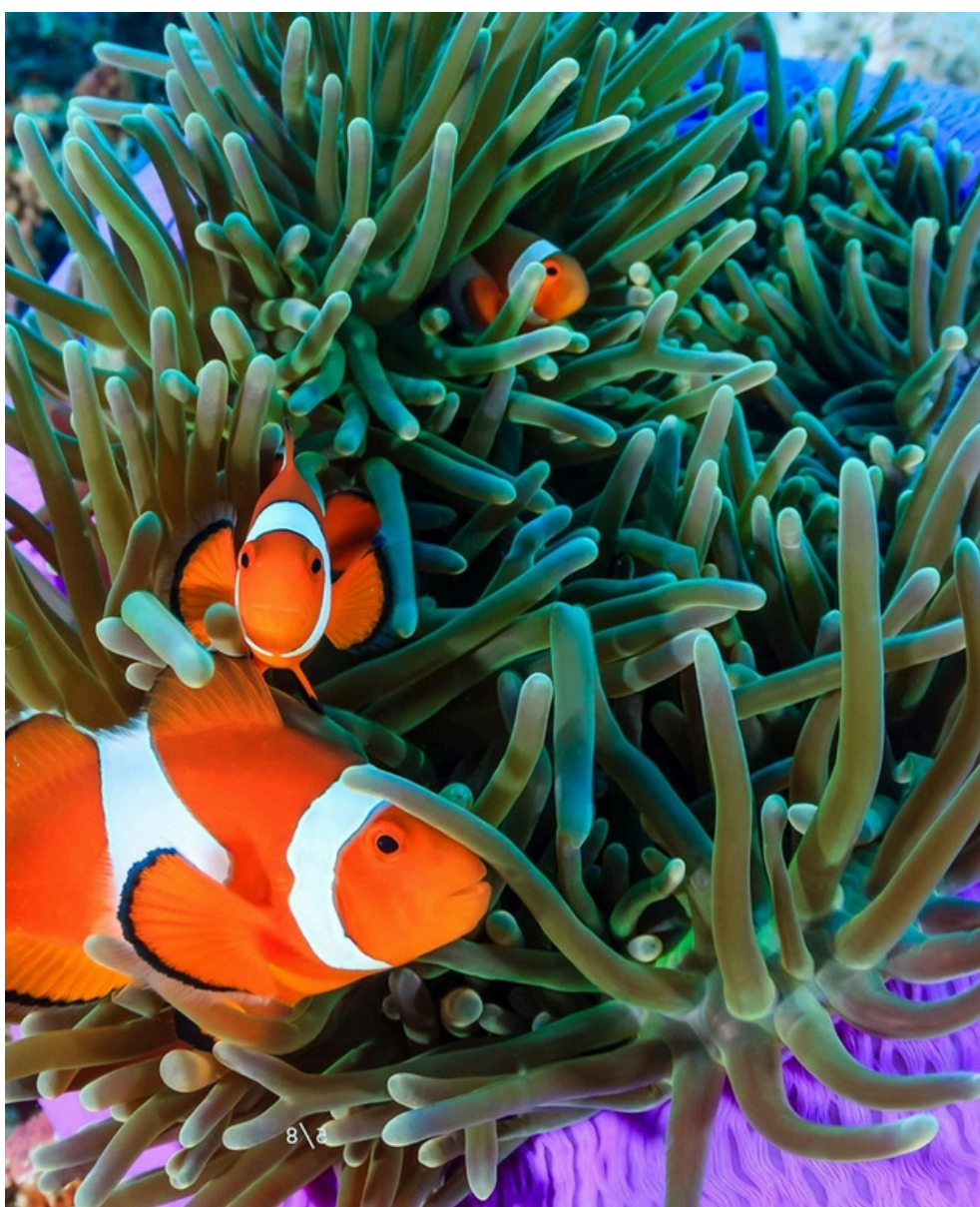
CLOWNFISH IN THE CORAL REEF, SPNI

Coral reefs are very sensitive to temperature. When the ocean gets too warm, corals become stressed and expel the tiny algae (zooxanthellae) that live in their tissues. These algae give corals food and color, so without them, corals turn white—a process called coral bleaching. Global warming causes more frequent heatwaves, giving coral reefs less time to recover. That's why 50% of reefs are already gone, and scientists say up to 90% could disappear in the next 20 years.