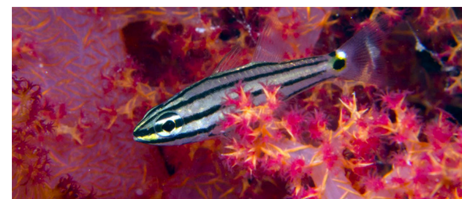
FISH IN THE CORAL REEF, DR. SHAI ORON

Imagine the coral as a giant building, and each tiny polyp is like an apartment in that building. When all the apartments (polyps) come together, they form a whole city, and this is what makes up the entire coral reef.