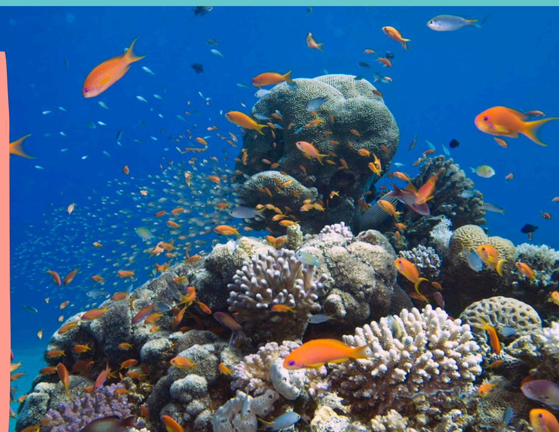
EILAT CORAL REEF, DR. SHAI ORON

This is a project within SPNI's Blue Half, focused on protecting the Gulf of Eilat. This project works to reduce environmental damage, push for stronger laws to protect the sea, make scientific research easier for the public to understand, and influence policies that support marine and coral reef conservation.