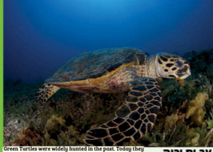
צב ים ירוק سلحفاة البحر الخضراء Green Turtle Green Turtles were widely hunted in the past. Today they are disappearing due to loss of coastal habitats and disturbance of egg-laying following coastal development, movement of people and vehicles, lighting, direct injury by sea craft, and accidental ingestion of plastic. It is also globally threatened.