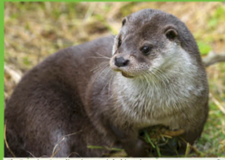
לוטרה كلب الماء Eurasian Otter The Eurasian Otter lives in aquatic habitats in northern Israel. It is disappearing due to river drainage, removal of streambank vegetation, pollution of freshwater bodies, and wildlife-vehicle collisions.