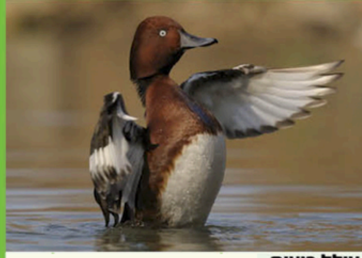
צולל ביצות بطة حديدية Ferruginous Duck Ferruginous Duck is disappearing due to drainage and intensification of aquatic habitats where it breeds. It is also globally threatened.