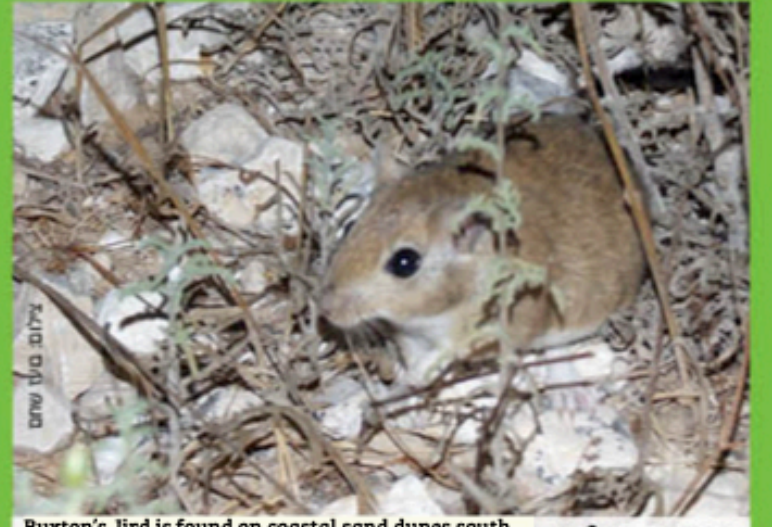
מרון חולות فأر الرمال Buxton Jird Buxton's Jird is found on coastal sand dunes south to the northern Negev. It is disappearing due to the expansion of farmland, settlements, roads, military activity, and off-road vehicle movement in these areas.