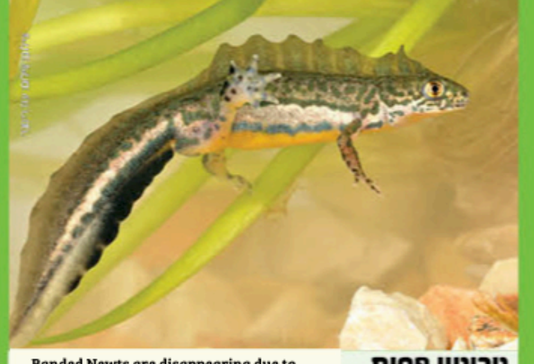
טריטון פסים سمندل الماء Banded Newt Banded Newts are disappearing due to destruction and drainage of wetlands, pollution of water sources and habitat fragmentation.