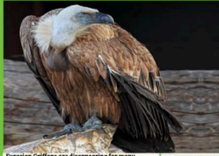
נשר מקראי النسر الأسمر Eurasian Griffon Eurasian Griffons are disappearing for many reasons, such as poisoning, diminishing food sources, electrocution and powerline collision, and disturbance at breeding sites. They are extremely vulnerable to collisions with wind farms.