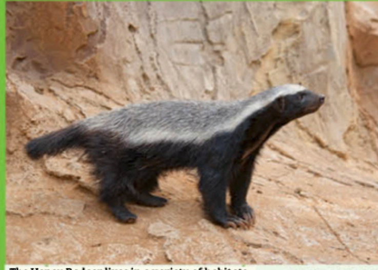
גירית דבש غريبر العسل Honey Badger The Honey Badger lives in a variety of habitats. It is disappearing due to wildlife-vehicle collisions, and poisoning and hunting by beekeepers, since the badger causes damage to beehives.