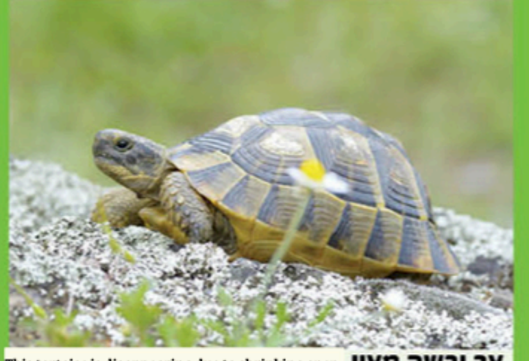
צב יבשה מצוי سلحفاة برية Common Tortoise This tortoise is disappearing due to shrinking open landscapes, illegal collection for home rearing, off-road vehicle movement, increase densities predators - crows and stray dogs. It is globally threatened.