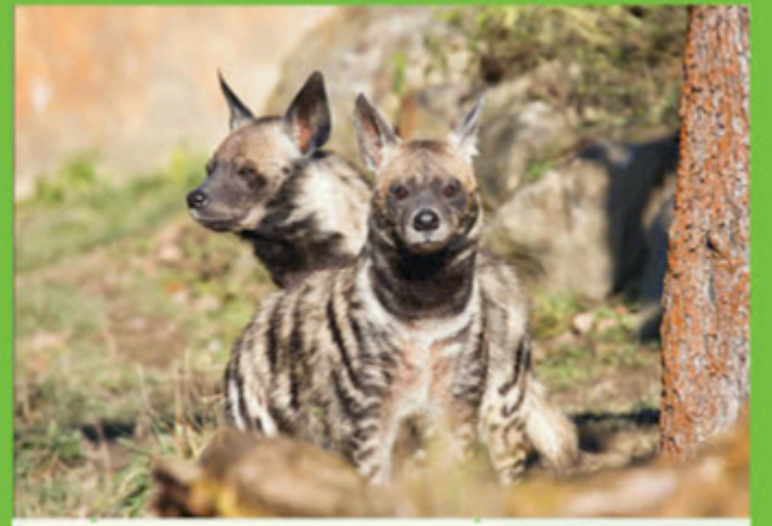
צבוע מפוספס ضبع Striped Hyena The Striped Hyena is a predator adapted to scavenging. It is disappearing due to the use of chemicals and pesticides in agriculture, and wildlife-vehicle collisions.