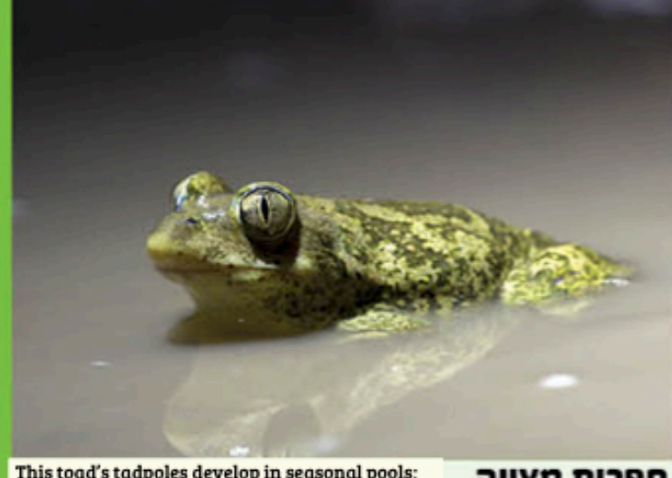
חפרית מצויה خلد Syrian Spadefoot Toad This toad's tadpoles develop in seasonal pools; adults survive the summer buried deep underground. They are disappearing due to habitat loss and degradation, and fragmentation.