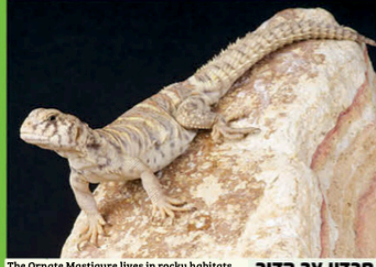
חרדון צב הדור ضب سيناء المزوق Ornate Mastigure The Ornate Mastigure lives in rocky habitats in warm deserts. It is being harmed by habitat loss, wildlife trafficking, habitat disturbance by off-road vehicles, and disturbance by tourists.