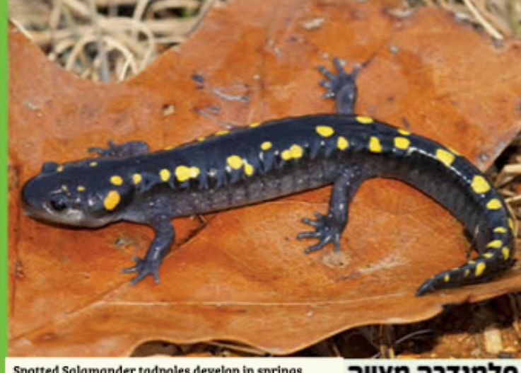
סלמנדרה מצויה عروس الماء، أبو رفلين Spotted Salamander Spotted Salamander tadpoles develop in springs, seasonal pools, and slow-flowing creeks. Adults live in aquatic habitats. They are disappearing due to habitat loss and degradation, including pollution. They are also globally threatened.