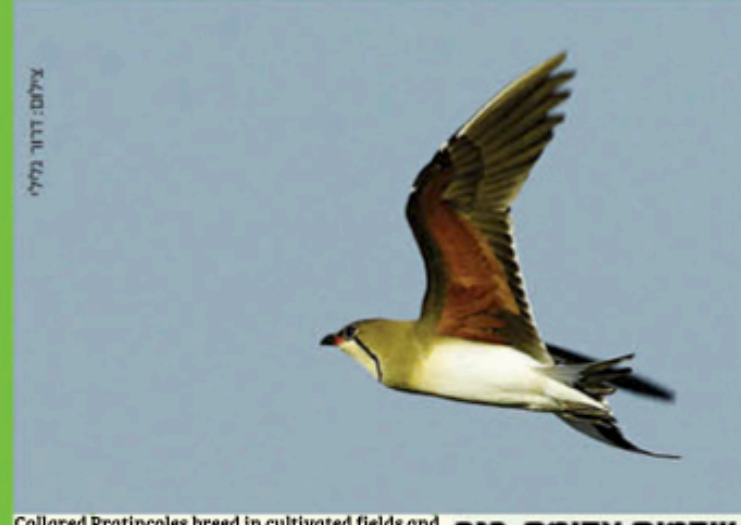
שדמית אדומת-כנף أبو اليسر Collared Pratincole Collared Pratincoles breed in cultivated fields and exposed plains. They are threatened by toxins in agriculture, loss of breeding sites due to infrastructure development and construction, and land-use changes – often caused by agricultural intensification.