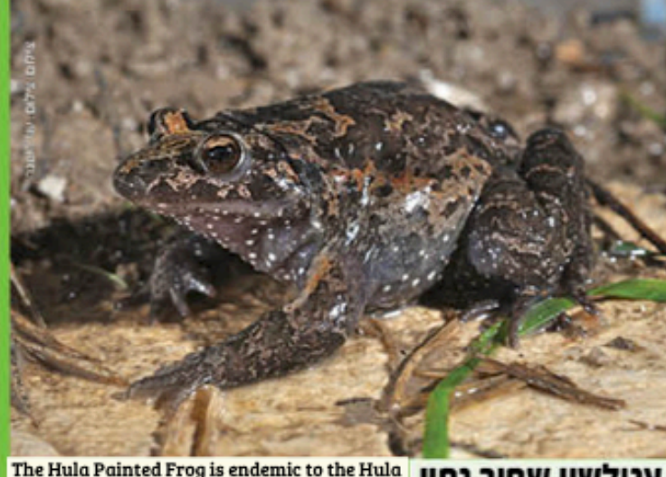
עגולשון שחור גחון الضفدع أسود البطن Hula Painted Frog The Hula Painted Frog is endemic to the Hula Valley. It disappeared when the Hula Lake was drained in the 1950s; surprisingly, a few individuals of this species were rediscovered in 2011. It is also globally threatened.