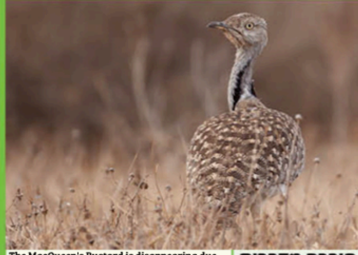
חבורה מדברית الحباري MacQueen's Bustard The MacQueen's Bustard is disappearing due to loss and degradation of its breeding grounds in the Negev, disturbance by grazing, military, and off-road vehicles, and hunting. It is also globally threatened.