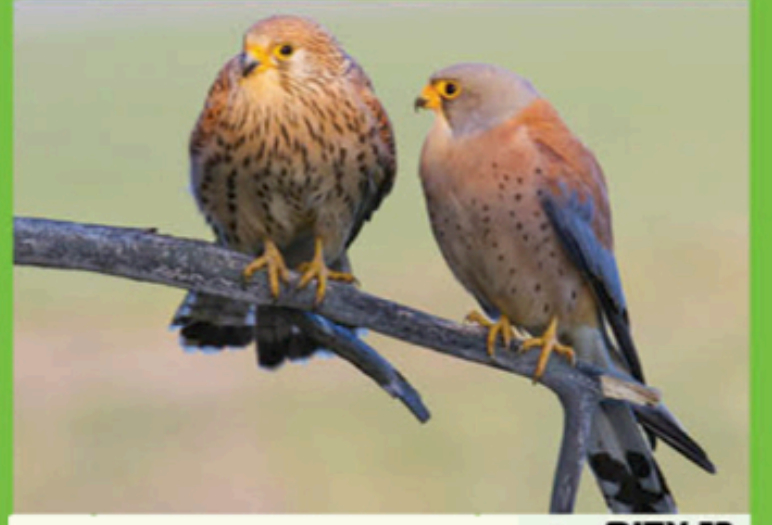
בז אדום العويسق Lesser Kestrel Lesser Kestrels are disappearing due to reduced food availability following urban expansion, agricultural intensification and loss of shrublands in which they hunt for food.