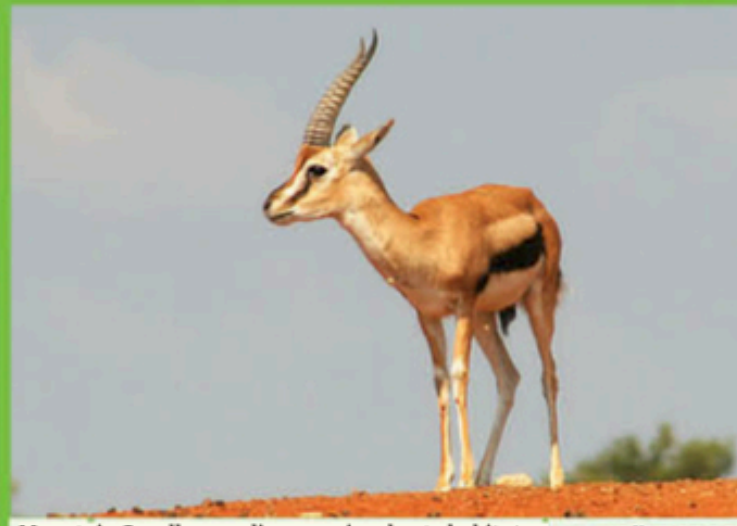
צבי א"י غزال Mountain Gazelle Mountain Gazelles are disappearing due to habitat fragmentation. Their populations are also being decimated by growing populations of predators such as stray dogs, illegal hunting, wildlife-vehicle collisions, and others. It is also globally threatened.