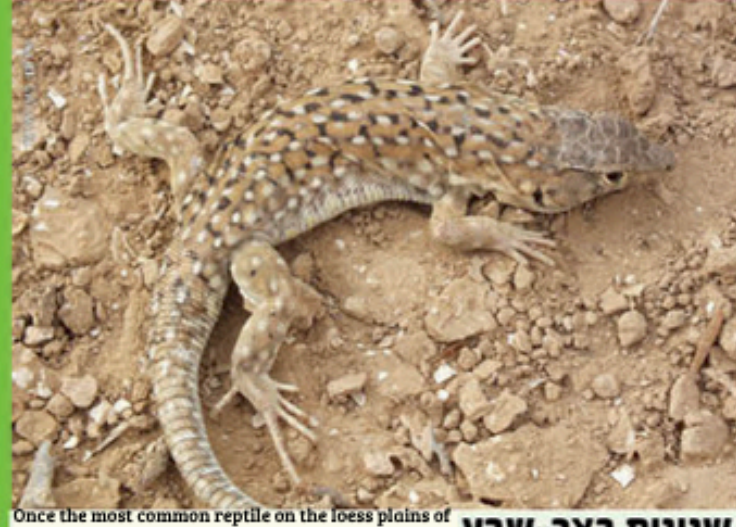
שנונית באר-שבע سحلية بئر السبع Be'er Sheva Fringe-fingered Lizard Once the most common reptile on the loess plains of the Northern Negev and Southern Judean Desert, the lizard resided in areas destroyed by housing development, agriculture, plantings, vehicle movement, grazing, and the spread of predatory cattle egrets. It is also globally threatened.